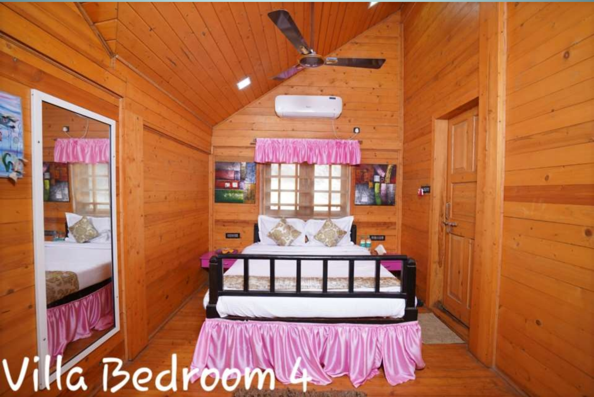
Villa Bedroom 4