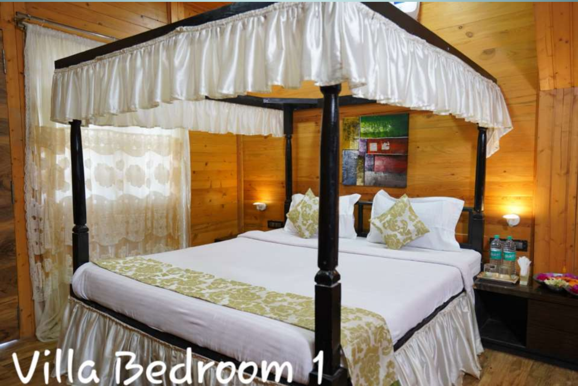
Villa Bedroom 1