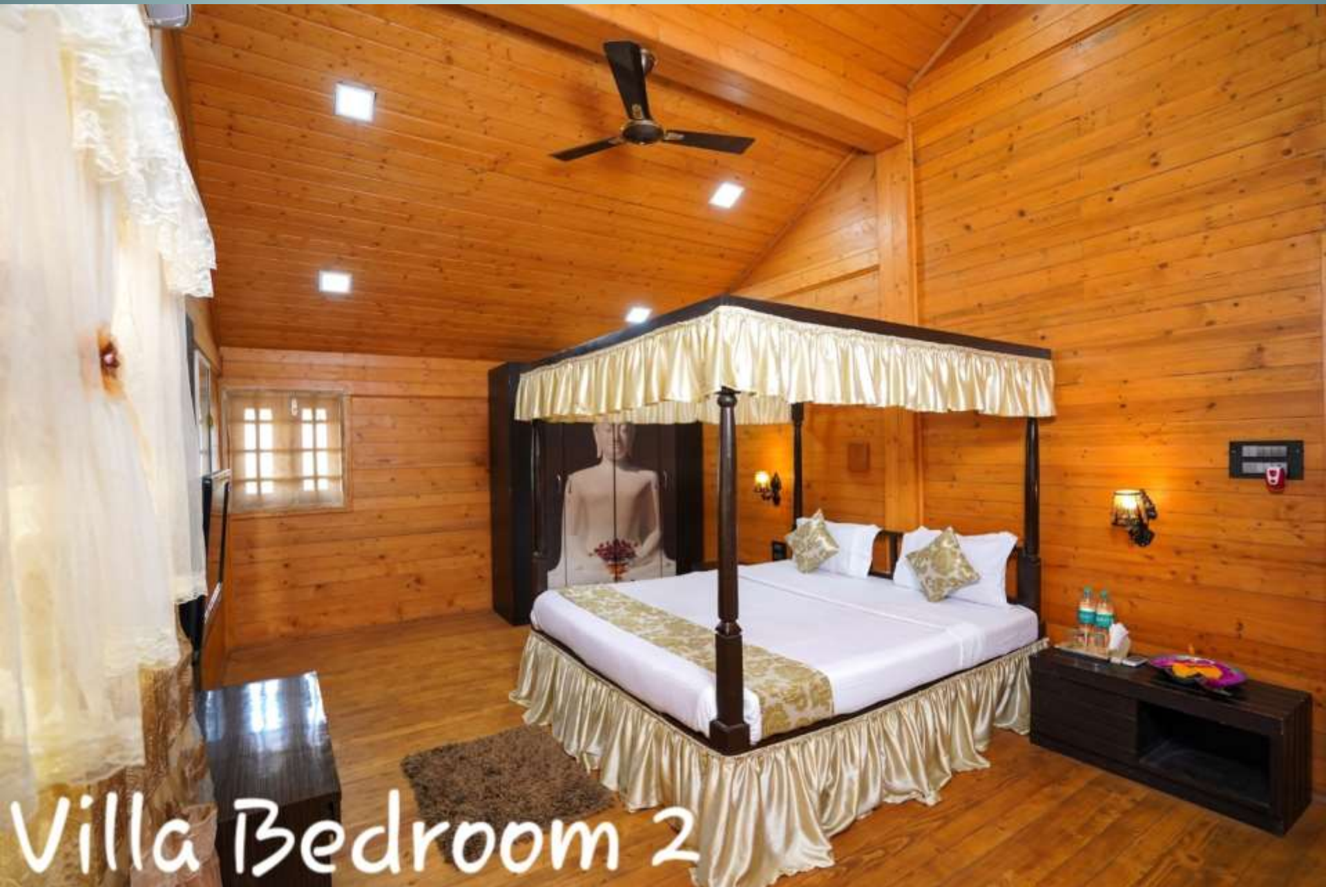
Villa Bedroom 2