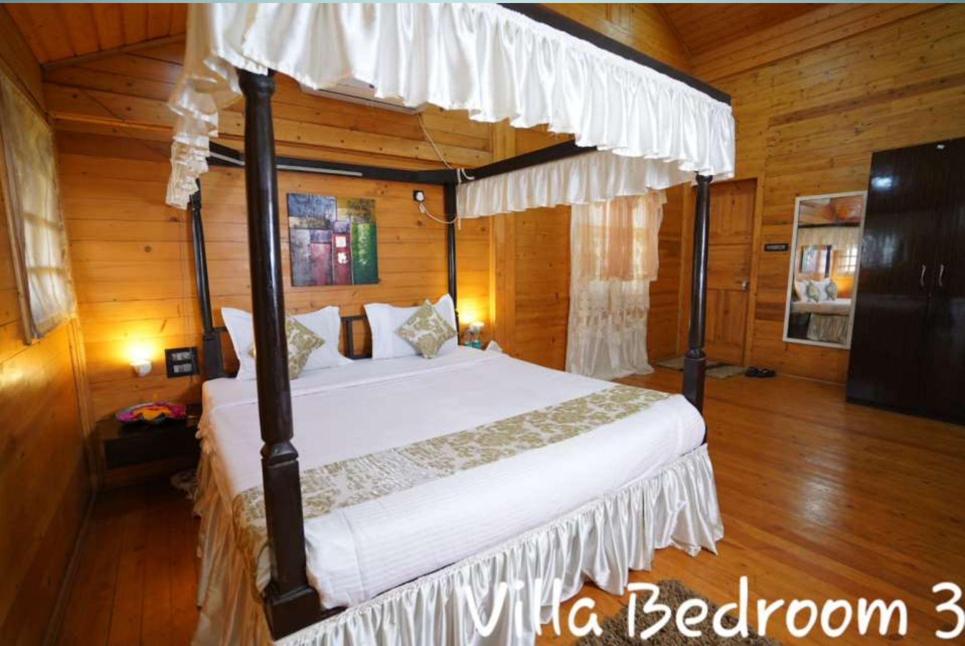
Villa Bedroom 3